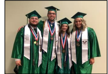
2021 Presidential Award Recipients

Students can complete school and community service to earn state/national Torch Awards. BPA is also a sponsoring organization for the U.S. Presidential Volunteer Service Medal. Students who complete over 100 hours of service from April 2021-February 2022 are eligible.