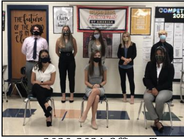
2020-2021 Officer Team